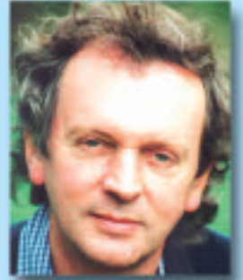
21st February - Dr. Rupert Sheldrake