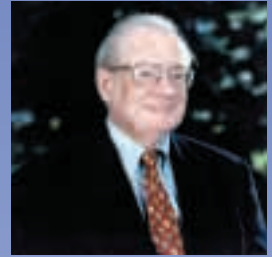
Dr. Raymond Moody

A world-renowned scholar, author and researcher, Dr. Raymond Moody is considered the leading authority on the Near Death Experience, a phrase he coined in 1975 with the publication of his international best-seller, Life After Life . Dr. Moody has his Ph.D. in Philosophy with honours from the University of Virginia, and a medical degree from the Medical College of Georgia. He did his residency in Psychiatry at the University of Virginia Medical School. He is a past recipient of The World Humanitarian Award, and the author of eleven books. He is an on-going expert with major media on the topics of grief, near death, unusual phenomena. Dr. Moody lives in Alabama, with his wife and two small children. This is his first visit to the UK for many years.